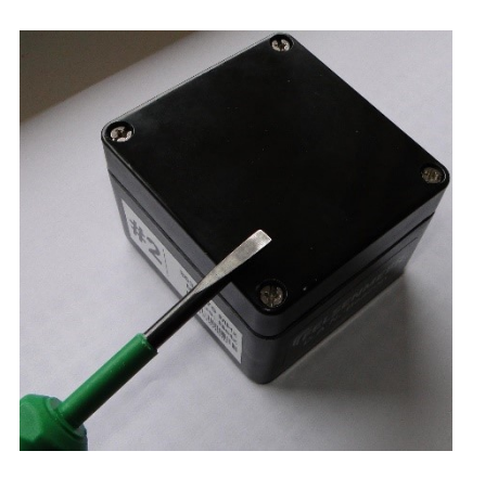
Figure 1: Opening the housing

Only trained personal shall commission the D.A.N.-Beacon. Take ESD precautions.