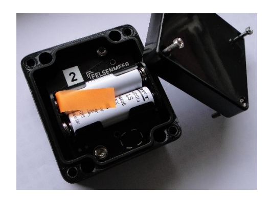
Figure 2: Opened housing, with isolation band

The D.A.N.-Beacon Ex checks whether the transmission channel is idle or busy, preventing collisions with other alarm equipment. If the channel is busy, it will retry to send its ID at a later point in time. This may cause the green LED to blink in some random way, instead of every four seconds. After a few minutes, a stable four second rhythm should be reached. If not, there is an interfering transmission going on. Check whether the D.A.N.-Beacon Ex can be received despite this interferer.