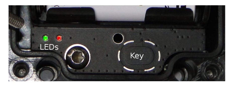
Figure 3: User interface

By default, the capacitive touch button is checked every four seconds to conserve energy. Push the button until the green LED stays on for 250ms and the device changes to interactive mode. This mode is indicated by the green LED: It flashes every 100ms and the red LED counts the currently set transmission level.